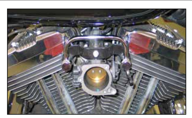
7. Install the K&N<sup>®</sup> crankcase breather tube onto the vehicle using the provided hardware. NOTE: Do not completely tighten the breather bolts at this time.

2. Remove the two air filter cover mounting bolts and then remove the cover from the vehicle as shown.