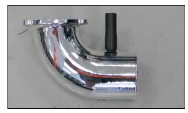
9. Cut the provided crankcase vent hose to a length of 1.75" and install onto the K&N ^{\odot} intake tube as shown.