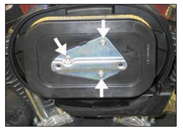
3.Remove the three air filter mounting bolts shown.

2. Remove the two air filter cover mounting bolts and then remove the cover from the vehicle as shown.