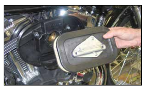
4. Remove the air filter as shown.